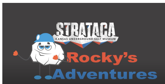
"Rocky" led video tours of the Strataca Underground Salt Museum with an HK Quick Grant

The pandemic has changed the way that programming is conducting, making virtual and "plan B" options a necessity. HK updated Humanities for All and Culture Preservation grant guidelines to encourage plans for virtual programming and a backup plan should stay-at-home orders be put into effect. HK's robust catalogs of Speakers Bureau presentations and TALK book discussions were quickly adapted for full-length online presentations. HK updated the online request forms to allow for an online presentation option so that program coordinators could easily plan their events. Upon hearing feedback that funds were a barrier to implementing Zoom or WebEx presentations, HK now provides funds to support a short-term Zoom or WebEx subscription. HK also created a document that provided instructions on how to set-up and run an online meeting via Zoom and other platforms to guide those who had no experience using that technology. 27 online events have reached an audience of 4,480.