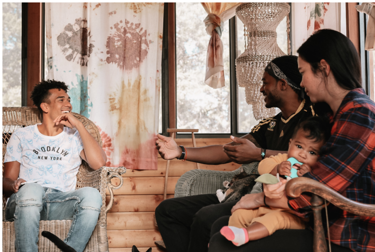
"A Place in Between: Life in Norton County during the 2020 Pandemic"