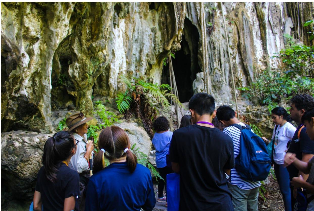
Taking Root visiting the Guam National Wildlife Refuge, 2018