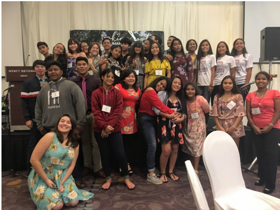
Taking Root Interns and Participants at the 1st Youth Sustainability Conference, 2018

Instructional supplies- The remaining DOI funds went toward instructional supplies for both indoor and outdoor activities including waterproof cameras and reef walking shoes.