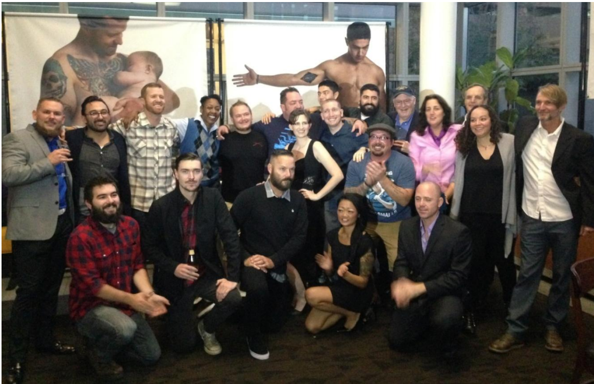
War Ink participants, staff, and supporters at the launch event in Oakland, November 11, 2014.